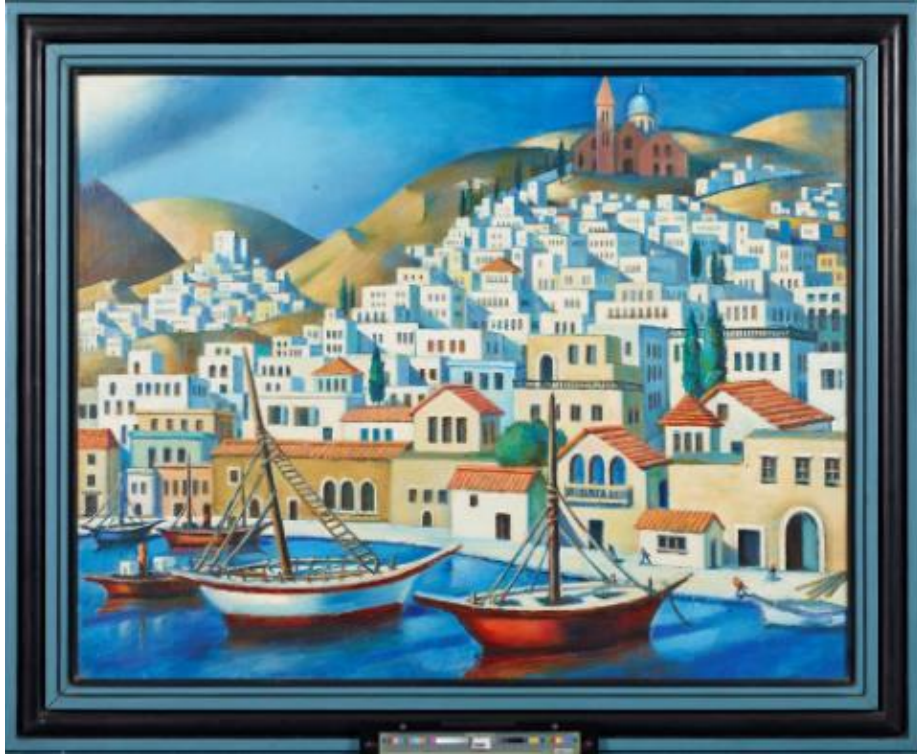
Mahmoud Said, View of Sirros (1949)