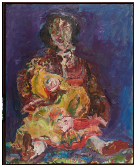
Marwan Kassab Bachi, Marionette (1980)